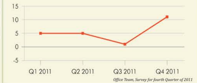
One-year history: Net percentage of HR managers planning to hire administrative professionals

"Choose a job you love, and you will never have to work a day in your life."